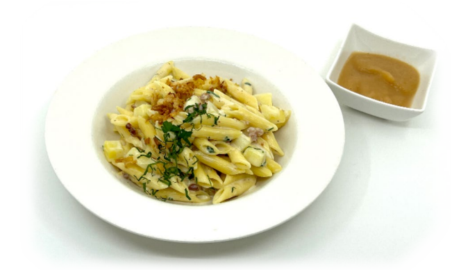
No. 7 Swiss alpine macaroni (with potatoes, cheese, bacon, onions) and apple puree