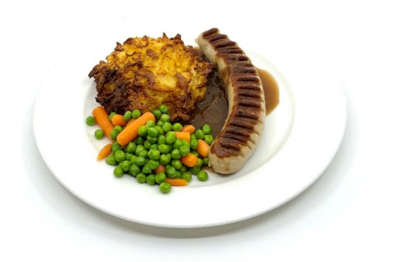
No. 8 Veal sausage with rösti and onion sauce