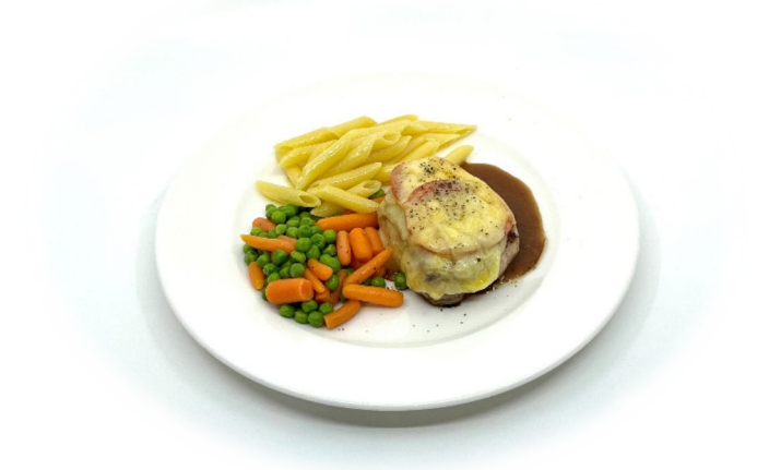
No. 6 Valais schnitzel (with tomato and cheese) with pasta and vegetables