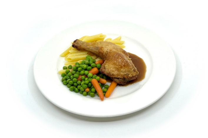
No. 3 Roasted chicken leg with pasta and vegetables